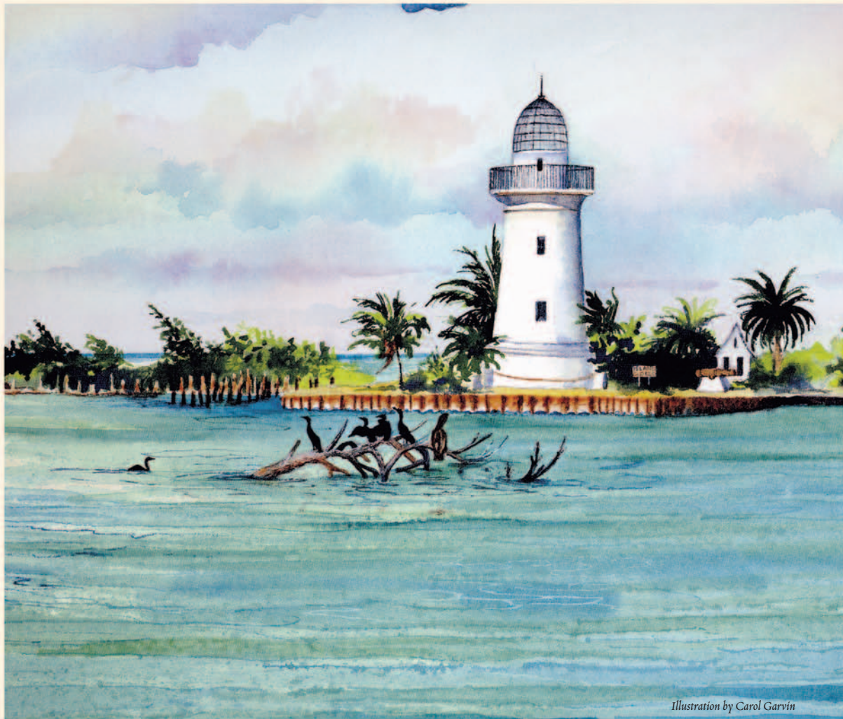
Illustration by Carol Garvin