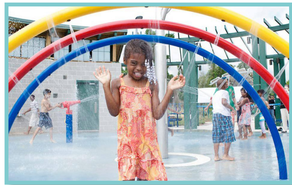
1. Recreation & Activities

From December 2022 - January 2023, five stakeholder engagement events were held for the community representing 'A'ala Park. This included residents, recreational park users, and local businesses and landowners. Community members were asked for their ideas and feedback on initial design concepts for park improvements and program ideas. The results of their feedback were analyzed and established a foundation for the next design and engagement phase.