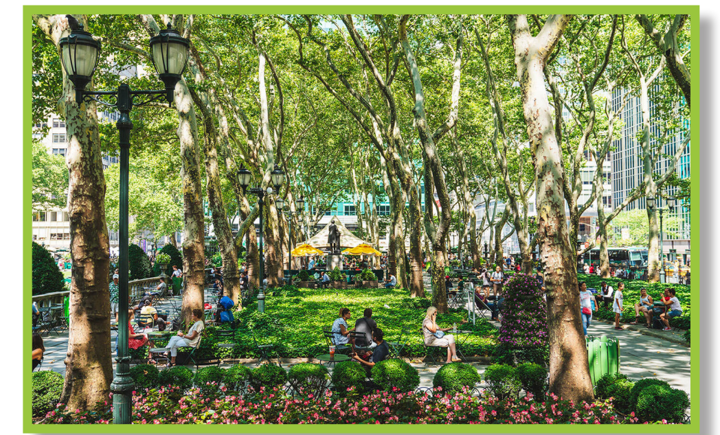
4. Health & Nature