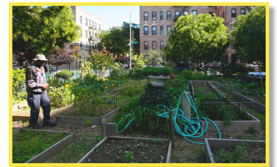
3. Community Events & Commerce