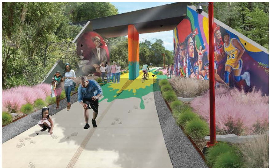
Proposed view of the Alton Park Trail facing south near CSX Rail overhead crossing 2020 Alton Park Linear Park Draft Vision

Economic revitalization of a historically black middle-class neighborhood, with a current black majority of 79%, and a community with a rapidly increasing Latino population, currently at 32%, by facilitating tourism, attracting investment and removing transportation barriers to vital commercial services.