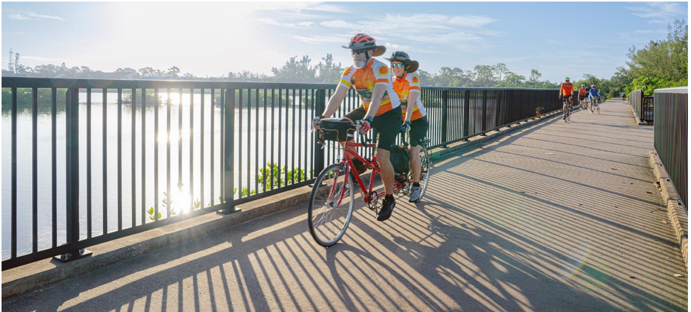
ROBERTS BAY BRIDGE. PHOTO BY MELODY TIMOTHEE