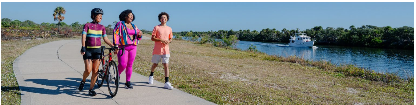
SHAMROCK PARK & NATURE CENTER. PHOTO BY MELODY TIMOTHEE