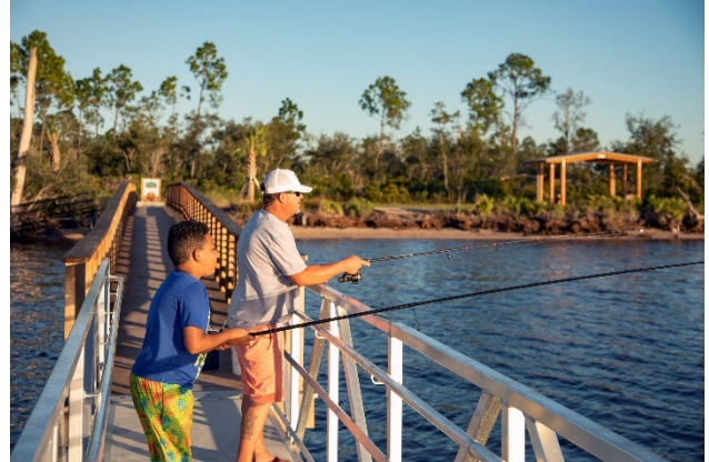
LYNN HAVEN BAYOU PARK & PRESERVE.

The philanthropic community is instrumental in realizing the Florida Gulf Coast Trail—a next-century regional destination. Working together, we will connect millions of people to the benefits and joys of the outdoors—for generations to come.