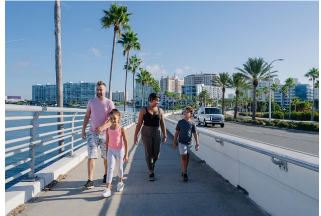
RINGLING BRIDGE, CAUSEWAY PARK. PHOTO BY MELODY TIMOTHEE